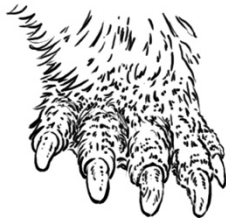
Artist's first drawing